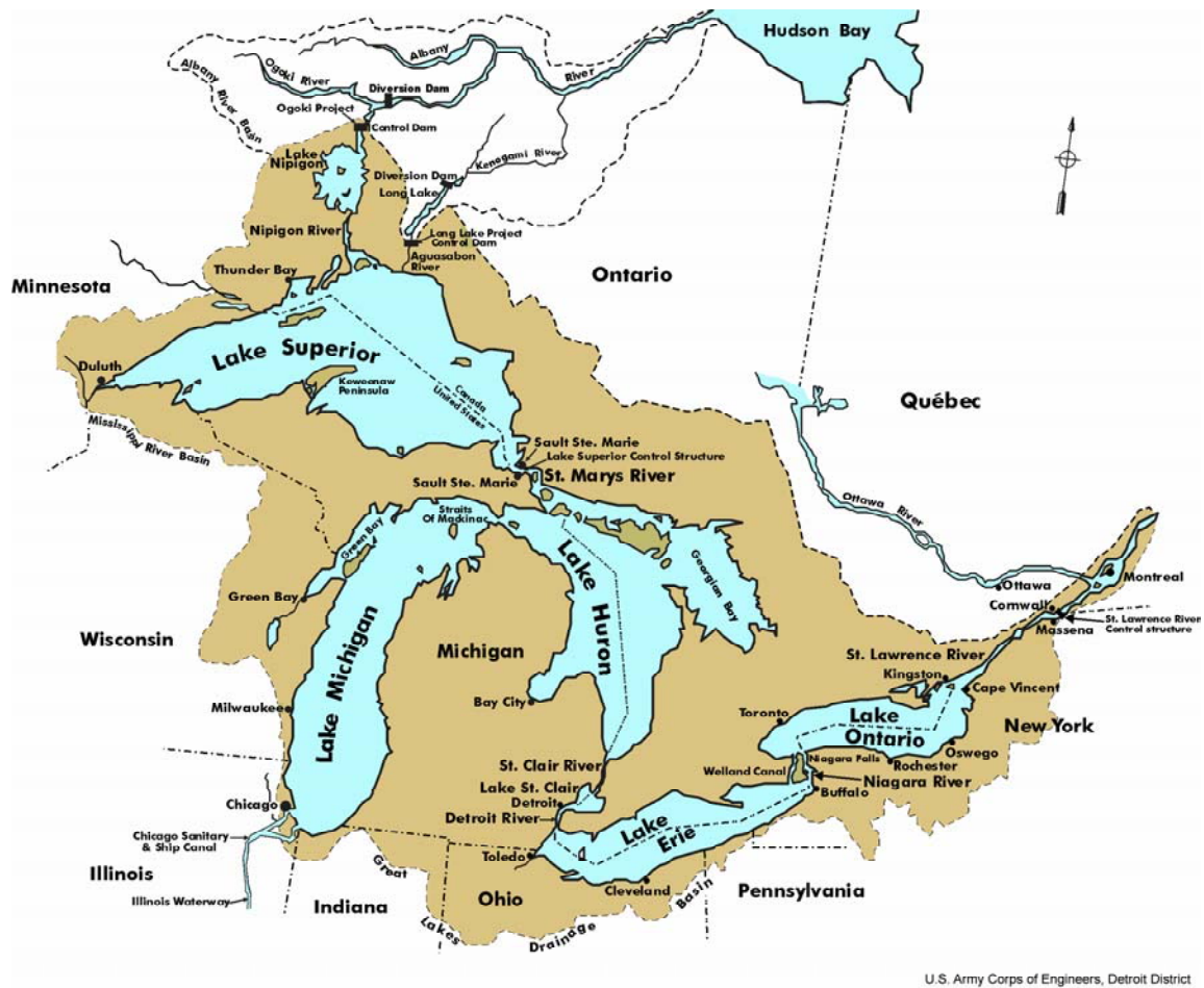
Figure 1. Great Lakes-St. Lawrence River System (GLIN, 2003) Available online at the GLIN Map Gallery: http://www.great-lakes.net/gis/maps/